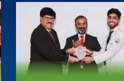
Award Distribution March 24, 2022