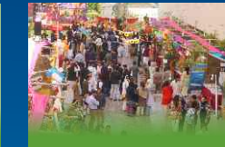
Fun Fair March 26, 2022