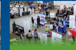
Career Fair March 28, 2022