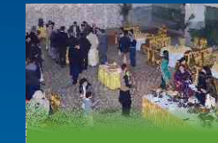
Alumni Dinner March 24, 2022