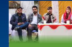
Medical Camp March 22, 2022