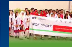
Sports Week March 21-25, 2022