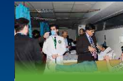
Blood Camp March 9, 2022